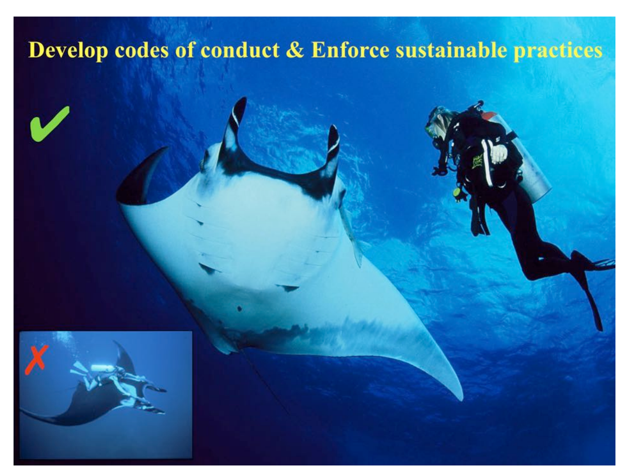
Figure 3. Species-specific codes of conduct- disruptive versus sustainable diving practices

detrimental impacts to Mozambique's coastal environment and resources. Specifically for manta rays, it will mean the slow and sustainable expansion of the diving industry. The development of codes of conduct for interactions with animals in the wild (to prevent the alteration of natural behaviour or worse still, emigration from the region) are also essential since preliminary research indicates that tourism can heavily impact the behaviour of manta ray species at both cleaning stations and feeding areas (Marshall et al. unpublished data).