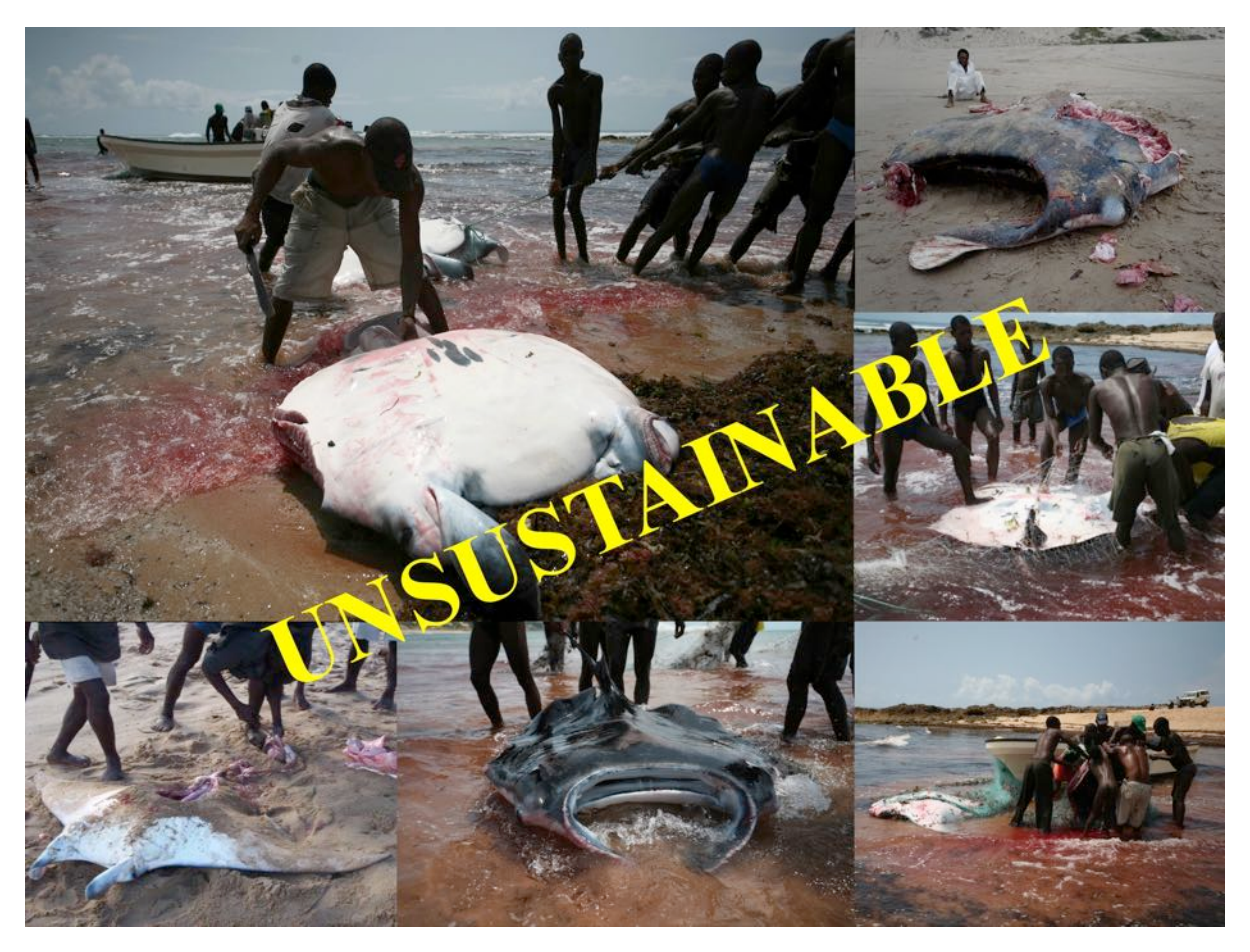
Figure 1. Manta rays killed in directed and indirect fisheries in the Inhambane Province.

home range (Marshall et al. 2011a). As a result the coastline of this province likely represents the most important habitat for manta rays along the eastern coast of Africa.